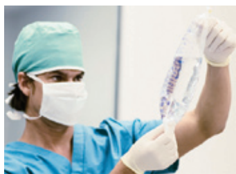
Color has earned a permanent place in healthcare processes.

This white paper highlights how color is commonly used in healthcare environments, explains the advantages and limitations for each printing and labeling technology for these use cases, and provides guidance to help healthcare organizations decide which technique is best suited to their workflows, user needs and IT environment.