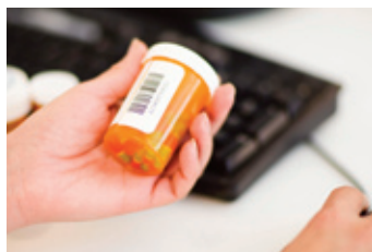
Barcode usage is growing steadily at both the pharmacy and point of care.

The sharpness and precision of the printed image itself also plays a role in the effectiveness of label-based healthcare processes. Barcode adoption is growing steadily for dispensing both at the pharmacy and at the point of care, and for file and records tracking, specimen identification, materials management and other uses. Barcodes must be produced to very demanding specifications for the widths of bars and spaces (which are measured in mils, or thousandths of an inch) and for the contrast between dark (bar) and light (space) elements. Printers developed for text-intensive document output often can't satisfy these requirements. Similarly, printers that produce acceptable traditional linear barcodes may not provide the same quality and reliability for two-dimensional (2D) barcode formats such as PDF 417, Data Matrix and Reduced Space Symbology (RSS), which are increasingly used for unit-of-use labeling, specimen tracking and patient wristbands.