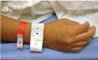
Color coding and color enhancement help facilitate patient safety.

There are many proven ways to apply color to improve processes. For example, the Agency for Healthcare Research and Quality (AHRQ) report, Mistake-Proofing the Design of Health Care Processes 1 cites multiple examples of how color enhancement and color coding can be effectively applied to protect patient safety, prevent errors and make processes more efficient. In practice, color is commonly used in three general ways in healthcare environments: