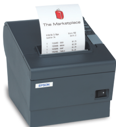
Epson’s TM-T88IV thermal printer offers fast, reliable printing and easy-to-use features.

Epson’s TM-T88IV printer is specifically designed to deliver high-speed, reliable receipt printing. Its small footprint and easy-to-use features, including drop-in paper loading, makes it ideal for service environments. “Epson’s TM-T88IV printer’s high-speed printing eliminates long lines on busy days and lets the hairstylists get to their next appointments faster,” said Schmittling. “Everyone likes to spend time admiring a hair cut or color, but no one wants to spend extra time at the counter when it’s time to go out into the world with a fabulous new style.”