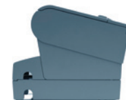
Power supply case fits under printer without increasing footprint size.