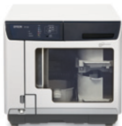
Epson's Discproducer disc publisher is built with Epson's world-renowned robotics and printing technologies.