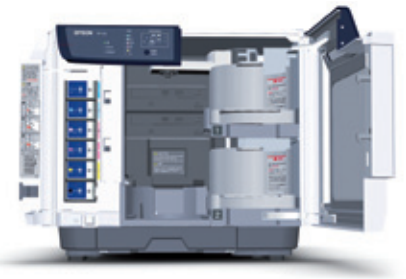
Discproducer offers total access from the front of the machine for easy operation and maintenance.

Epson Discproducer disc publisher Epson Total Disc Maker software CD Solutions hardware