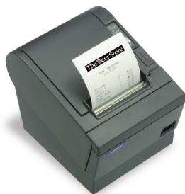
Epson's TM-T88III is the perfect solution for high volume retail environments like The Beer Store.