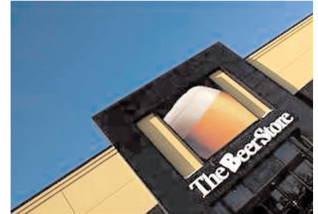
The Beer Store depends on Epson TM-T88III printers in 436 stores to help keep lines moving.

Hardware and Software: NRT Technology Corp. of Toronto.